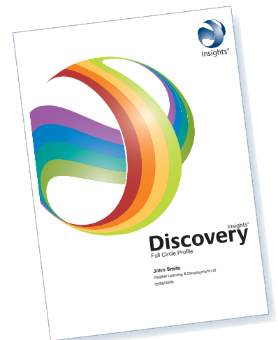
Insights Discovery Full Circle Wheel